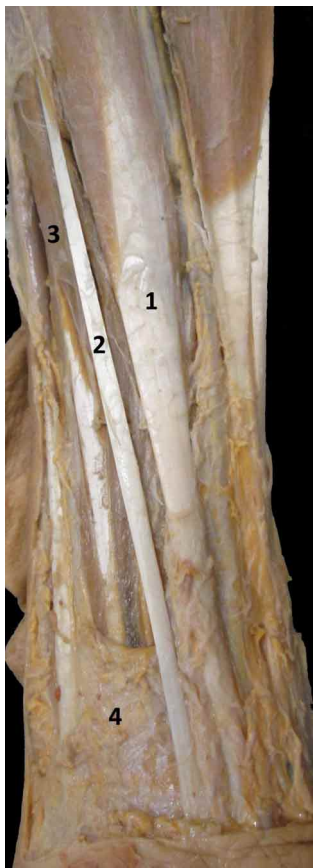
Fig 1. Anterior view of the left forearm. 1= tendon of the flexor carpi radialis muscle; 2= tendon of the palmaris longus muscle; 3= flexor digitorum superficialis muscle; 4= retinaculum of flexor muscles.

Table II summarizes the measurements of the width of the PL and RCE muscle tendons and their radial half at their origin level, the width of the PL muscle tendon at the level of the radiocarpal joint and the width of the RCE