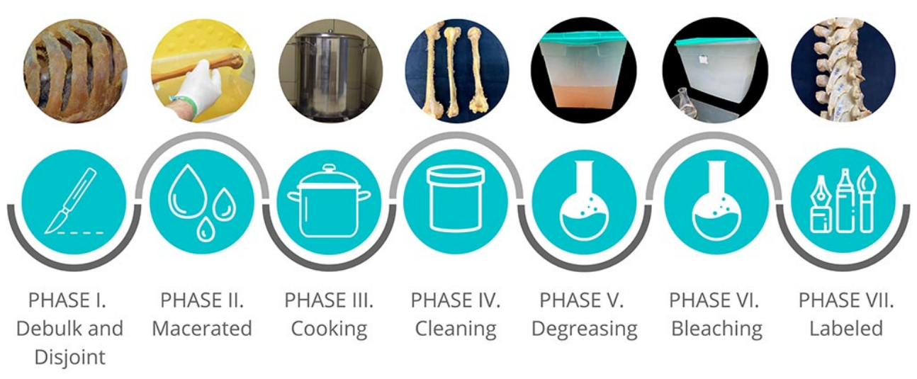
Fig. 1. Osteotechnics process according to each of its phases.

Disjoint. Disjointed consists of the separation of the axial and appendicular skeletons and more specific segments by cutting ligaments and tendons using the scalpel. First, the head is disarticulated, at the level of the C7. The rib cage will be limited to the L5. The upper members are divided into 4 sections: (1) scapula and clavicle (i.e., pectoral girdle), (2) brachium, (2) antebrachium, (4) carpus, metacarpus and phalanges. The lower members are also divided: (1) coxal, (2) femur, (3) patella, (4) tibia and fibula bones, and phalanges, (5) tarsal and metatarsus. The disarticulated body is placed in blanket bags of different sizes and according to the body segment to be placed. In the largest blanket bag that measures 100 x 100 cm, the spine whose vertebrae are articulated from C7 to L5, all the ribs and the sternum, the pelvic girdle, and the long bones are placed inside the torso first. In smaller bags measure 30 x 30 cm the hands and feet are placed. In a medium-sized bag measure 50 x 50 cm the skull is placed together with the jaw. In addition, it is supervised that there are two metal chips with ID number of the individual to avoid confusion and keep the bone material always identified. All the blanket bags are tied with a cord to prevent loss of bone samples, facilitate cleaning and lateralization of the bone segments, mainly the hands and feet.