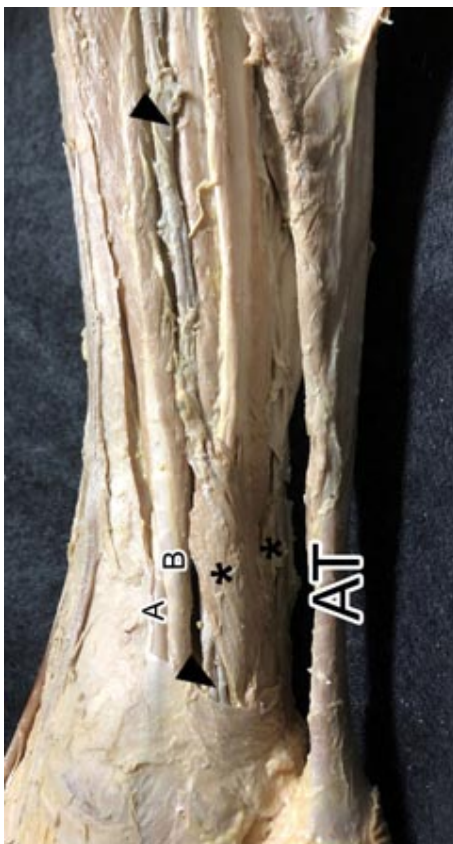
Fig. 1. Three supernumerary muscle bands and vascular nervous bundle (arrowhead) in the right leg (medial view). The peroneus quartus muscle is situated laterally and beneath both accessory bellies (asterisk) of the flexor digitorum longus. Posterior Tibial (A) and (B) Flexor Digitorum Longus Muscles.

The two accessory bellies of the flexor digitorum longus originated near the intermuscular crural septum and the belly of the flexor hallucis longus muscle. They emitted a tendon that passed the tarsal tunnel and joined the main flexor digitorum longus before originating the tendon for each finger. Both bellies were supplied by branches of the tibial nerve.