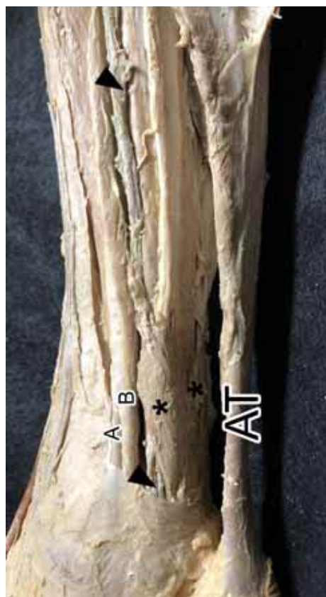
Fig. 1. Three supernumerary muscle bands and vascular nervous bundle (arrowhead) in the right leg (medial view). The peroneus quartus muscle is situated laterally and beneath both accessory bellies (asterisk) of the flexor digitorum longus. Posterior Tibial (A) and (B) Flexor Digitorum Longus Muscles.

A male cadaver fixated in a 10% buffered formalin solution was dissected during regular anatomy lessons. It