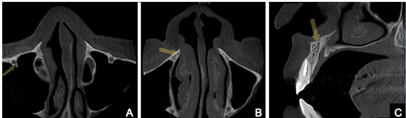
Fig. 1. A. Axial section CBCT image, showing the origin of the right canalis sinuosus, located posterior of the infraorbital foramen (arrow). B. Axial section CBCT image, showing the right canalis sinuosus posterior of its bifurcation in the lateral nasal margin of the pyriform aperture (arrow). C. Sagittal section CBCT image, showing the emergence of the right canalis sinuosus in the floor of the nasal cavity, close to the anterior nasal spine (arrow).

The presence and number of AC were evaluated (Fig. 2). The AC were classified as defined by de Oliveira-Santos et al. , according to the region of their terminal portion: upper central incisor, between the upper central and lateral incisors, upper lateral incisor, upper canine, and adjacent to the incisive foramen (anterior, posterior or lateral). The diameter of the AC was measured in the terminal portion, using as reference its anterior, posterior, lateral and medial margins.