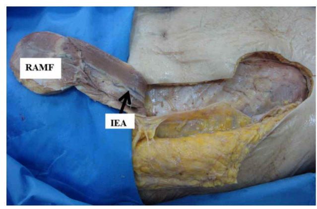
Fig. 3. Anatomy of the inferior epigastric artery (IEA) and rectus abdominis muscle flap (RAMF).

In 18 (90 %) dissections, venous drainage was provided by a pair of venae comitantes that united to form a common vessel at their draining point on the external iliac vein. One vein was usually larger in diameter than the artery. The average diameter was 3.9 mm (Fig. 4).