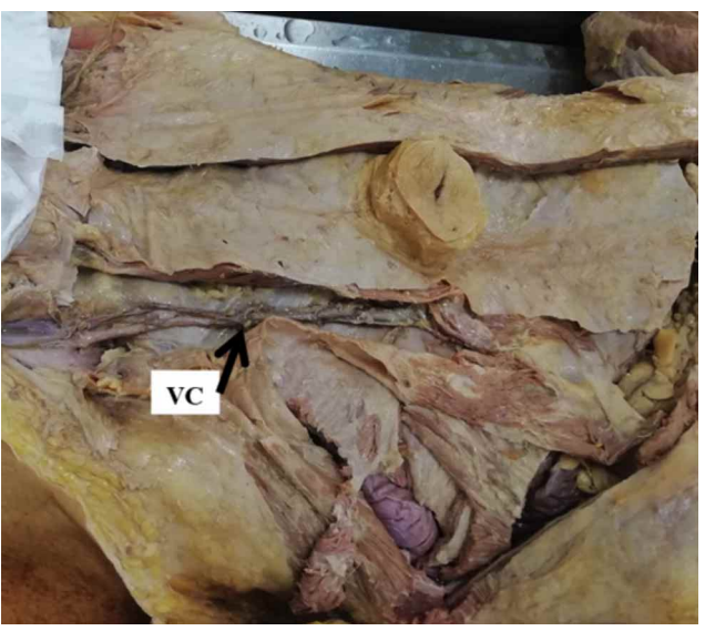
Fig. 4. Anatomy of the vena comitants (VC) of the inferior epigastric artery (IEA).