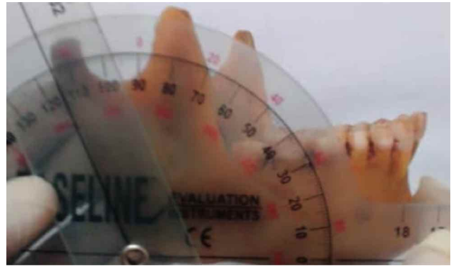
Fig. 2. Anthropometric method used in determination of the angle of the mandible.

Data analysis. The mean and standard deviation for each distance used to locate the mandibular foramen were calculated separately for both right and left mandibles using Stata. The mean distances of this population were compared with other ethnic groups from previous similar studies. Differences were considered statistically significant when p < 0.05 .