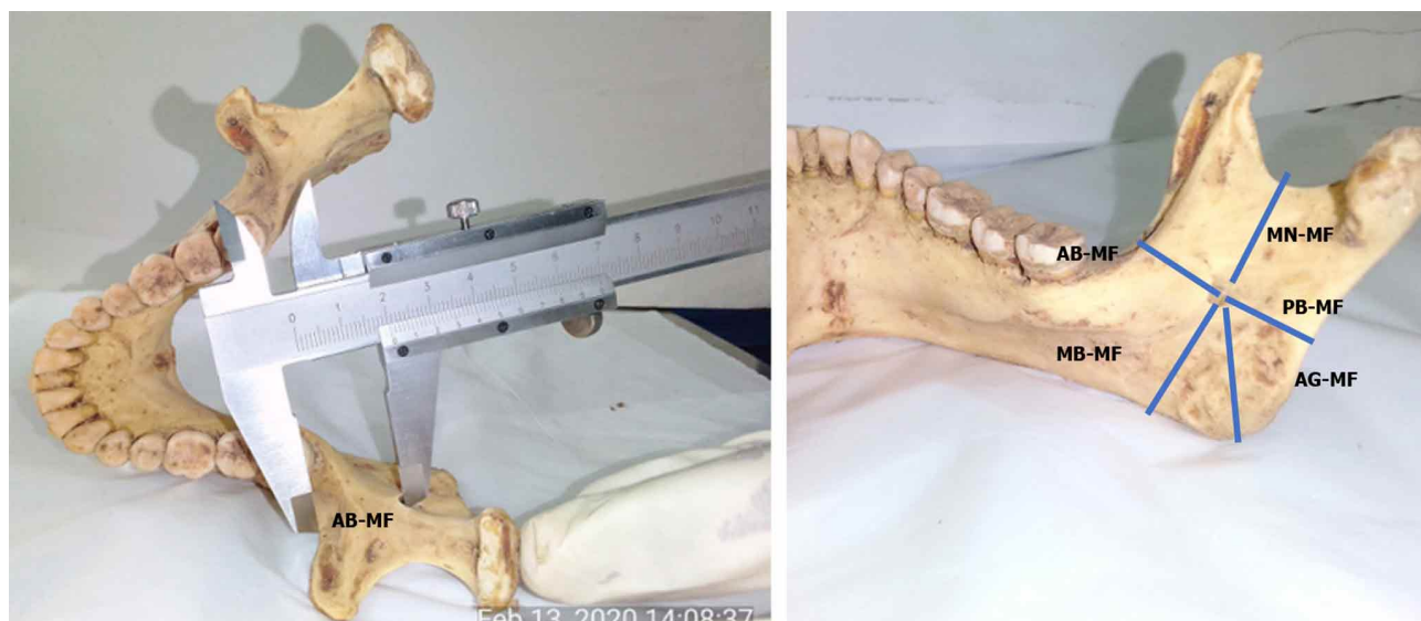
Fig. 1. Measurement of MF from anterior margin (AB-MF), posterior margin (PB-MF), mandibular notch (MN-MF), mandibular base (MB-MF) and gonial angle (AG- MF)

This study was conducted in accordance with the Government of Malawi Anatomy Act No.14 of 1990 and was approved by the University of Malawi's College of Medicine Research and Ethics Committee (COMREC) with a clearance number P02/10/872. The study was conducted on adult cadaveric dry mandibles obtained from the Anatomy Division Collection of Human Skeletons housed in the Biomedical Sciences Department, College of Medicine, University of Malawi. The sample included only dry mandibles prepared from adult black Malawian cadavers. A total of 29 dry adult human mandibles of unknown sex, aged 21- 82 years, were studied from the skeletal collection. Malformed and broken bones were excluded from the sample. To precisely locate the mandibular foramen, the following parameters were taken using a sliding Vernier caliper (Fig. 1):