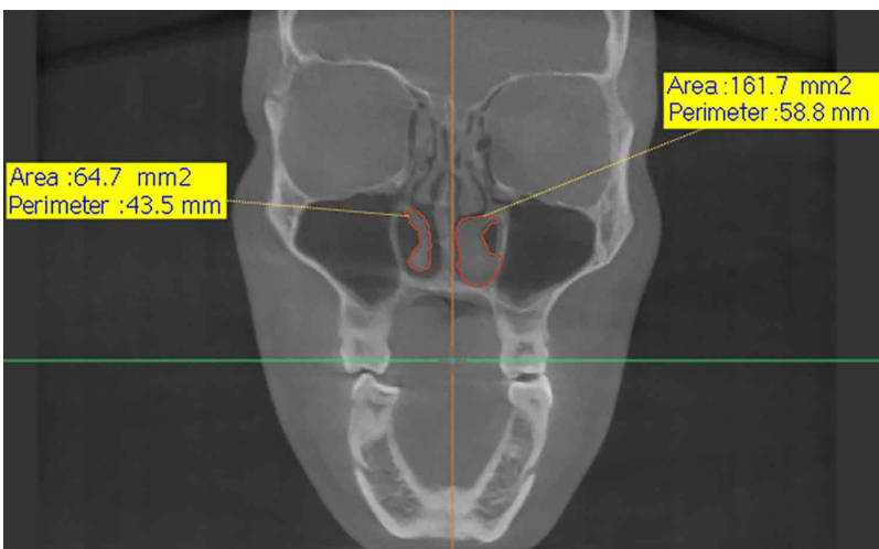
Fig. 3. CBCT showing the measurement of the left and right inferior turbinate, comparing the area between them.