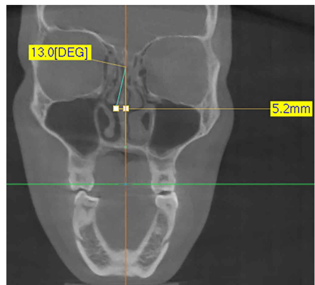
Fig. 1. CBCT showing measurement of the angle in the nasal septal deviation.

1) Nasal septum: The presence or absence of deviation was determined; the angle of deviation was analyzed with a line from the ridge of the crista galli to the septum at its lowest portion on the nasal floor and the line from the tangential crista galli point to the most lateral part of the deviation (Fig. 1). In addition, the distance between the midline of the nose and the most lateral part deviated from the nasal septum was measured (Fig. 2).