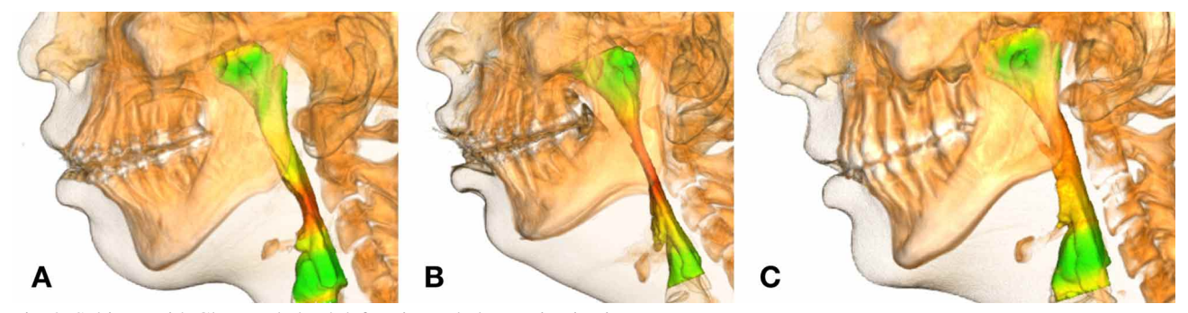
Fig. 2. Subjects with Class II skeletal deformity and observation in airway.

however they still present limitations due to the three-dimensional form of the human body. In 2014, our group (Olate et al. , 2014) indicated dimensional changes in the airway by 2D analysis, showing that subjects with Class II facial deformity presented a smaller airway area based exclusively on sagittal measurements. We also indicated that the nasopharynx presented limited differences, showing that the position of the mandible was the most important in this definition since a more retracted position of the hyoid bone was also related with a more retracted position of the mandible.