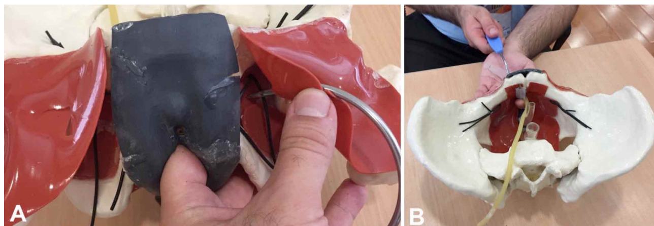
Fig. 2. (A) Photo of outside to inside TOT needle insertion performance on model. (B) Photo of TVT needle insertion performance on model.