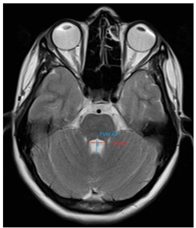
Fig. 3. Axial T2-weighted Turbo Spin Echo MRI (TR:3600, TE:87 ms) of measurement areas of healthy subjects. (FVWAP) The anteroposterior width of the fourth (4th) ventricle. (FVWT) The transverse width of the fourth (4th) ventricle. (PTD)

(TVW) The width of the third (3<sup>rd</sup>) ventricle (The maximum width of the third ventricle) (FVWAP) The anteroposterior width of the fourth (4<sup>th</sup>) ventricle (The maximum width of the fourth ventricle from anteroposterior). (FVWT) The transverse width of the fourth (4<sup>th</sup>) ventricle (The maximum transverse width of the fourth ventricle).