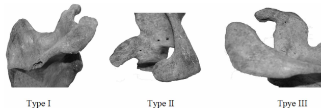
Fig. 3. Type of acromion according to shape. Type I; cobra, Type II, square; Type III; intermediate.