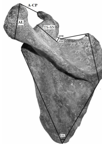
Fig. 2. Morphometric measurements of the scapula. SNW, suprascapular notch width; SND, suprascapular notch depth; TS-SN, distance between the supraglenoid tubercle and deepest point of the suprascapular notch AL; acromion length; A-CP, distance between the acromion and coracoid process; USA, upper scapular angle; LSA; lower scapular angle.