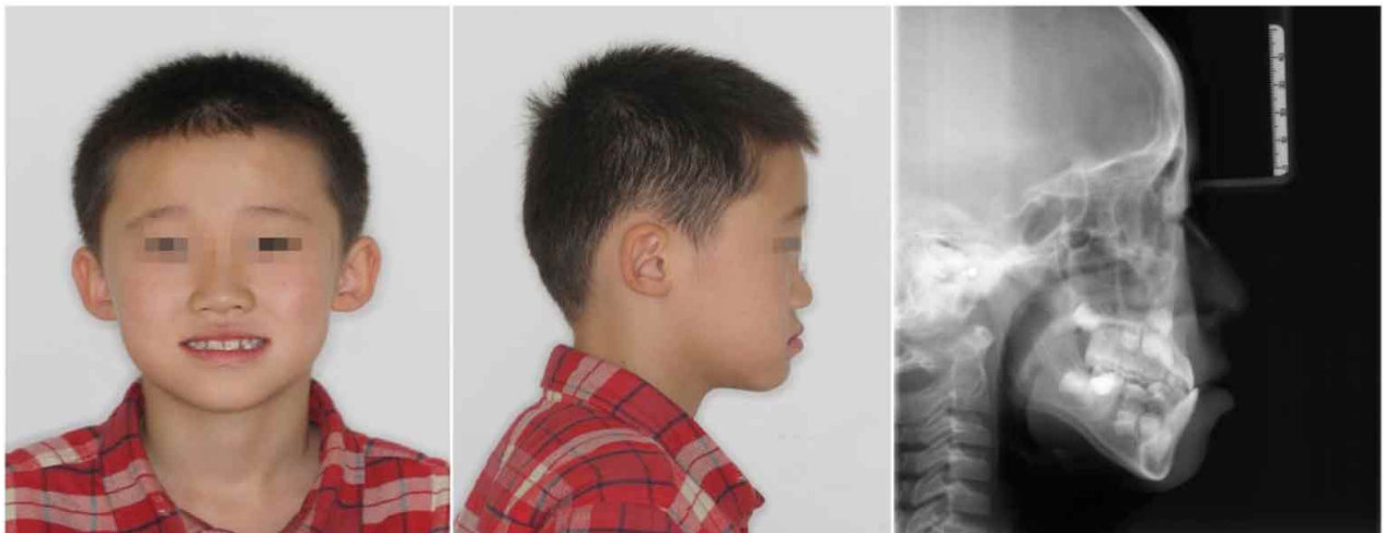
Fig. 3. Skeletal class III malocclusion patient before treatment.

Typical cases. Changes of facial and lateral radiographs before and after treatment of typical cases (Figs. 3 and 4).