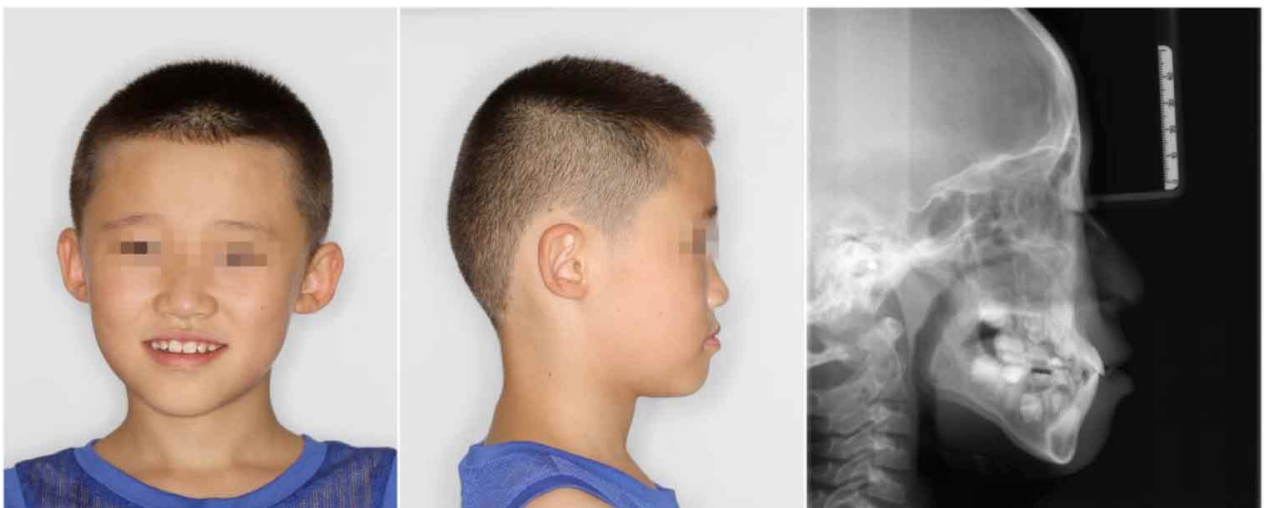
Fig. 4. Skeletal class III malocclusion patient after treatment.