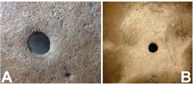
Fig. 3. The exocranial and endocranial surface of the trepanation. Both edges are rounded.

The Description of the Trepanned Opening. The opening is on the left parietal bone (os parietal) (Fig. 2). It is almost circular in shape, located 17.5 mm from the suture sagittalis (pars obelica), that is 46 mm above the suture lambdoidea (pars media). The diameter of the aperture is 9.3 mm. The skull is 4.2 mm thick around the trepanned part. The edge of the opening is rounded on the in- and outside, cured and regular (Fig. 3). Under 45x magnification, the diploid