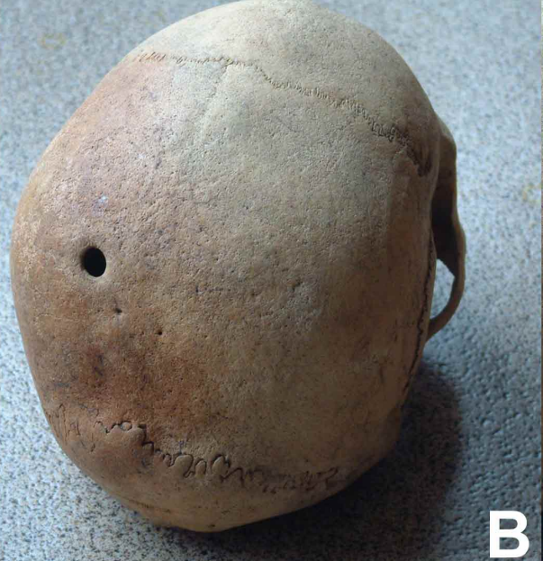
Fig. 2. The lateral and upper view of the skull. The trepanned opening is a regular circle 9.3 mm in diameter.