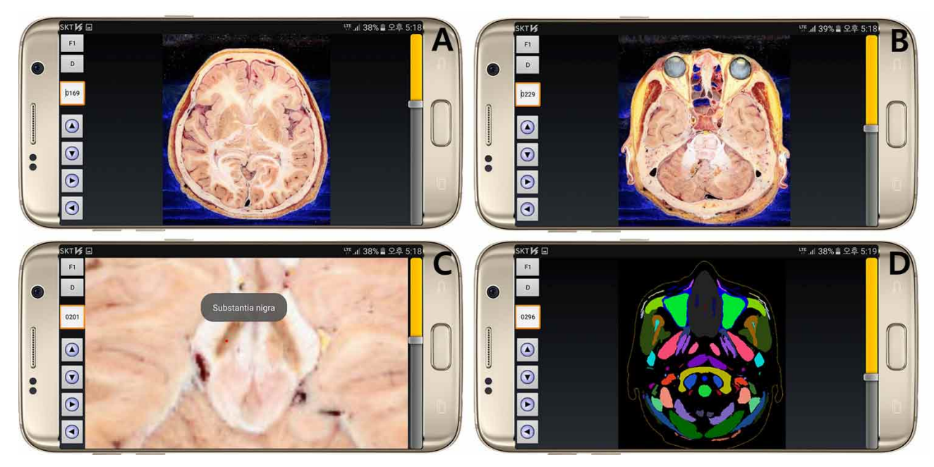
Fig. 3. Screen captures of browsing software on Samsung Galaxy S7 when sectioned images are browsed (A, B); an image is zoomed in; the name of the structure is displayed by double clicking over a specific structure (C); the sectioned image is replaced by the segmented image (D).