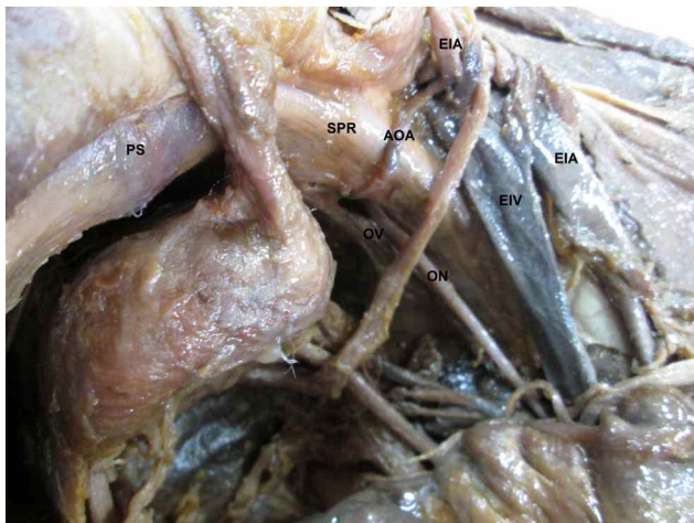
Fig. 2. Origin of the aberrant obturator artery from the inferior epigastric artery in the right hemipelvis. PS = pubic symphysis; EIA = epigastric inferior artery; SPR = superior pubic ramus; AOA = aberrant obturator artery; EIA = external iliac artery; EIV = external iliac vein; ON = obturator nerve; OV = obturator vein.

epigastric artery. In the left hemipelvis (Fig. 1), its length was 36.41 mm and the diameter at the origin was 2.77 mm, whereas in the right hemipelvis (Fig. 2), its length was 36.93 mm and the diameter at the origin was 2.8 mm. Both vessels formed an arc around the superior pubic ramus, and going back to it reaching the obturator foramen. Right AOA was found to 49.23 mm from pubic symphysis and 6.29 mm from the arc of the lacunar ligament; left AOA, to 47.24 mm from pubic symphysis and 5.11 mm from the arc of the lacunar ligament.