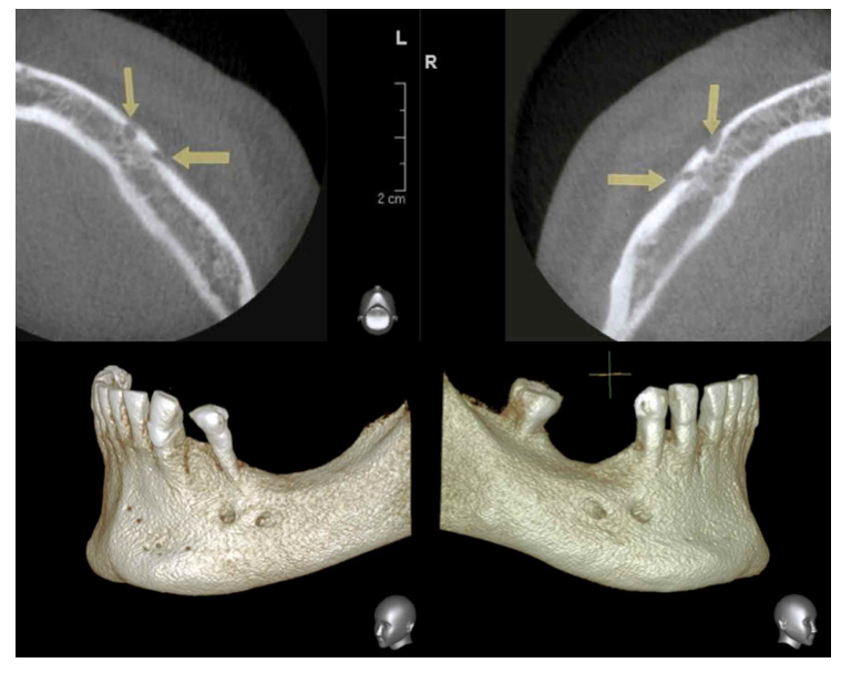
Fig. 2. The accessory mental foramen on the male patient's right and left sides are seen in axial CBCT images, and show the mental foramen and accessory mental foramen (arrows). Inferior images show the Three-dimensional reconstruction with the location of the accessory mental foramen in each side.

from the MF to the AMF was 3.3 ( \pm 1.5) mm, with the AMF located right above or distally to the MF (Table I).