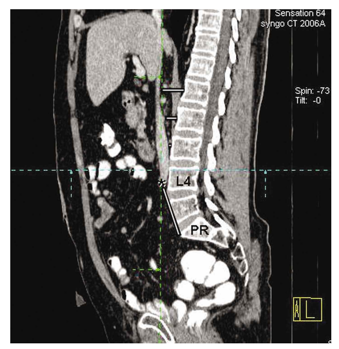
Fig. 1. Sagittal reformatted image (*indicates: Iliocaval confluence, Oblique line: The distance of the iliocaval confluence from the promontory level, Horizontal lines: The distance of the inferior vena cava from the lumbar vertebral body, L4= Fourth lumbar vertebra, PR= Promontory level).

This study was performed on radiologic images, taken for various medical reasons (leukemia, colon cancer, acute pancreatitis, abdominal pain, liposarcoma etc.), of 200 cases (100 male and 100 female). Images were obtained using a 64-slice multidetector row CT machine. The cases with cardiovascular pathology, disc herniation and spinal disorders were excluded from the study. The study cases ranged in age from 50-84 years and their sex, height, weight and body mass index were recorded. The morphometric data in the axial, sagittal and the coronal sections were obtained. Ethical approval of the study was obtained from the Non-Invasive Clinical Research Ethics Committee (ethical clearance number: 2013/480).