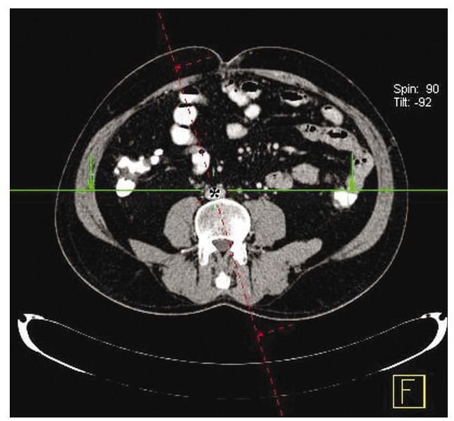
Fig. 2. Axial reformatted image was used for the measurement of the distance of the iliocaval confluence from the lumbar vertebra, the level of the iliocaval confluence according to the lumbar vertebra (* indicates: Iliocaval confluence).