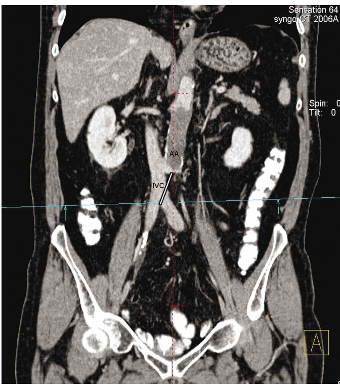
Fig. 3. Coronal reformatted image (IVC= Inferior vena cava, AA= Abdominal aorta; Oblique line= Vector distance between the iliocaval confluence and the aortic bifurcation).