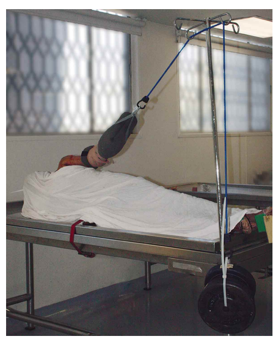
Fig. 1. Positioning the body for the placement of arthroscopic portals. Anterior view.