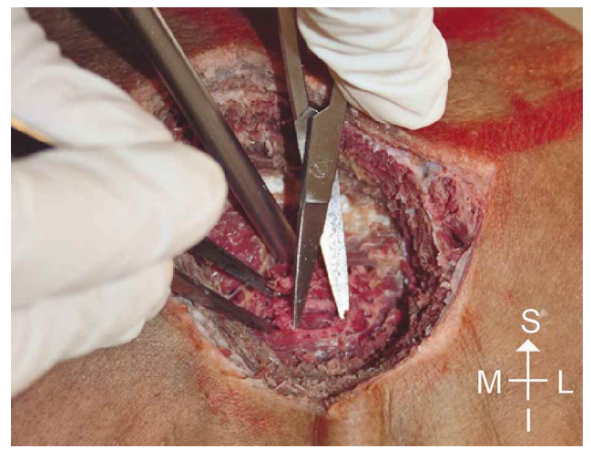
Fig. 2. Punch dissection technique used to evaluate the small microvasculature near the SPP (standard posterior portals).

Data Presentation . The structures at risk of being injured were graphically documented at each site by reporting their position within the circumference of dissection. Variables such as the diameter of each structure and the mean distance from the portal (all in millimeters) and the anatomical plane in which it was located were reported.